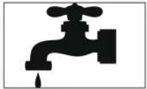
WATER PIPE LINE