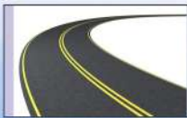
BLACK TOP ROADS