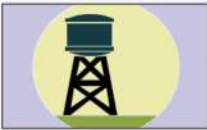
OVERHEAD WATER TANK