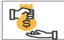
BANK LOAN FACILITY